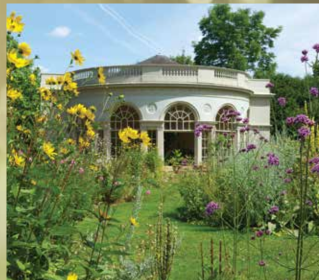
Images show Osterley Park & Grand Union canal